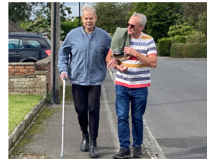
Photo of a volunteer guiding a client using sighted guiding skills.

Description: Discover practical tips to confidently guide a friend or family member with sight loss, enhancing their independence in everyday settings, perfect for those needing occasional support in changing light or diverse environments. Booking Essential